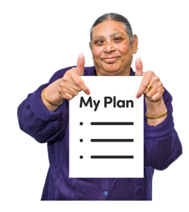
Make a plan for if you get ill - your care, food & tablets